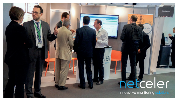
Buzz around IVPower at NetCeler's booth

We were lucky (and happy) that IVPower users were able to meet at our booth by chance, therefore in the most natural way! A few images and videos were shot during some of these exchanges.